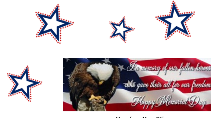
Monday, May 25